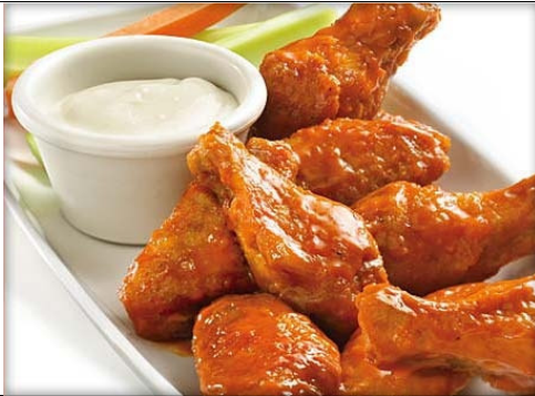
Buffalo Chicken Wings